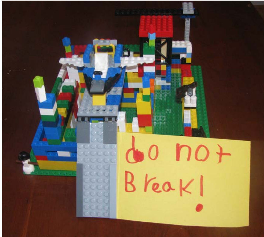
Image 3: Rules for playing with toys.