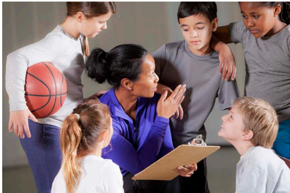
Image 2: Basketball coach.